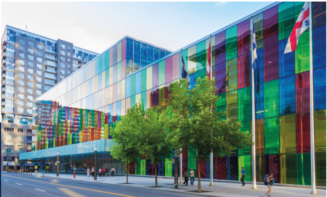
PALAIS DES CONGRÈS, MONTRÉAL, QUÉBEC

1001 Pl. Jean-Paul-Riopelle, Montréal, QC H2Z 1H5, Canada